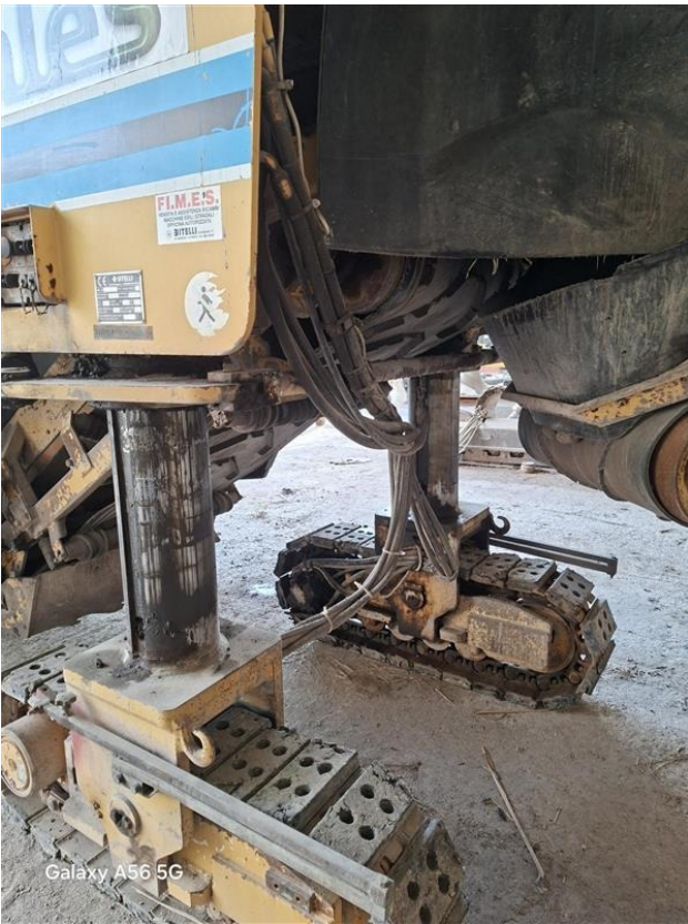
Galaxy A56 5G