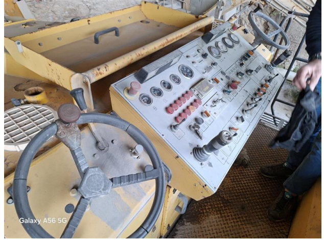
Galaxy A56 5G