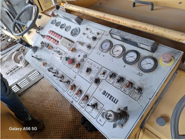
Galaxy A56 5G