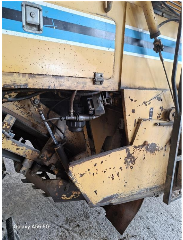
Galaxy A56 5G