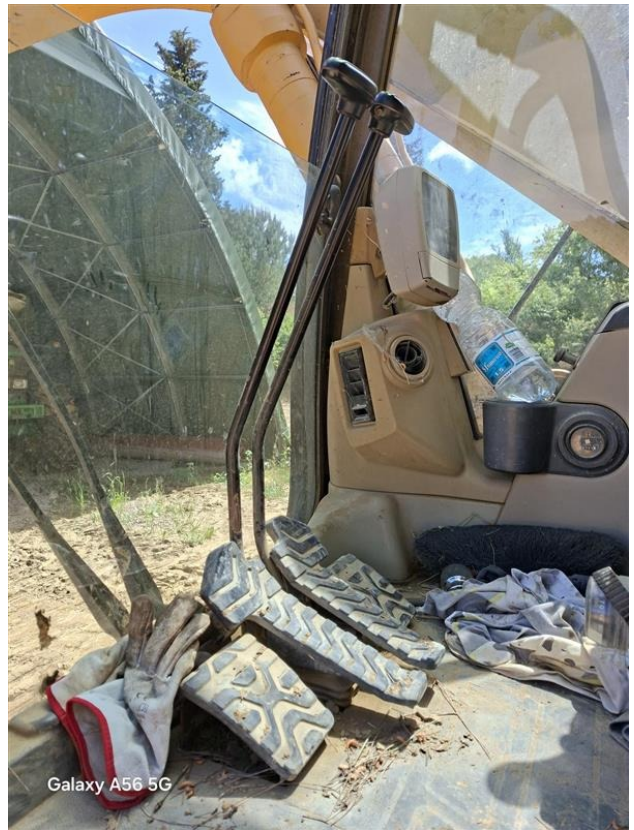
Galaxy A56 5G