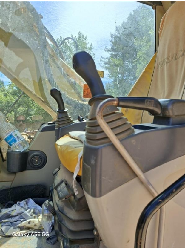
Galaxy A56 5G