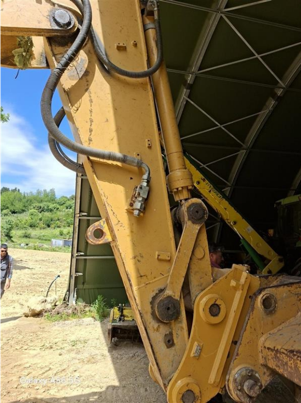
Galaxy A56 5G