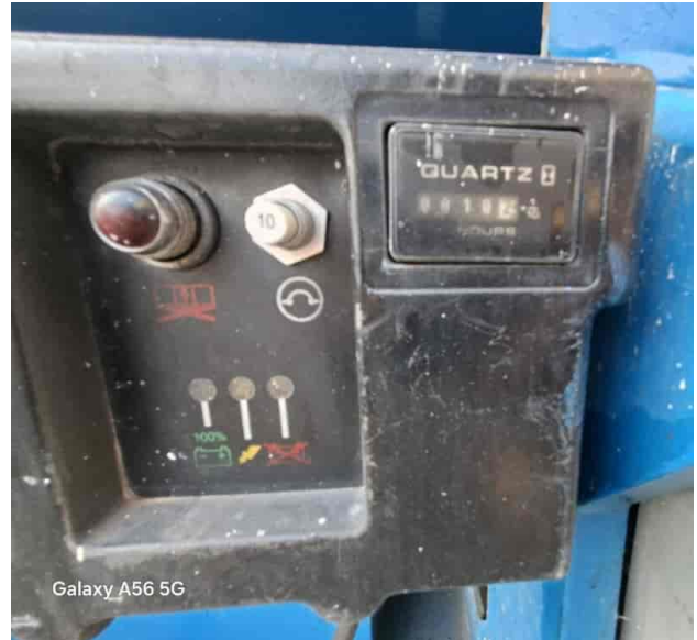
Galaxy A56 5G